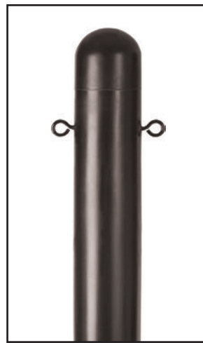
Two screw eyes (one on each side).