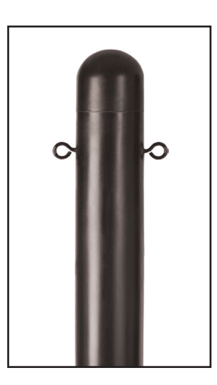
Two screw eyes (one on each side).