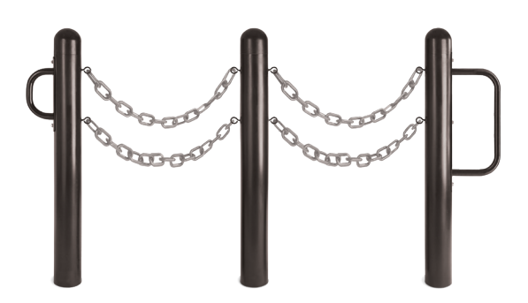
Optional short handle and two screw eyes on one side; four screw eyes, two on each side; optional long handle and two screw eyes on one side. In-ground mount. Chains not included.

Surface mount. In-ground mount. 4 screw eyes (2 on each side), 2 screw eyes (1 on each side), 2 screw eyes (2 on one side), 1 screw eye (1 on one side), no screw eyes. One long handle. One short handle.